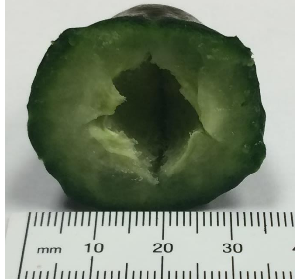
Figure 3. Unlike other fruiting crop disorder, hollow heart is not the result of insufficient pollination. By lowering air temperature, EC, or nitrogen