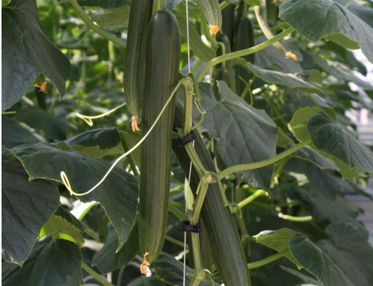
Figure 2. Whether or not cucumbers have hollow heart cannot be determined obviously by simply looking at the fruits; samples must be taken and cut open to identify this disorder.