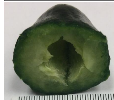
Figure 1. Cucumber hollow heart develops when fruits can't fill during periods of rapid growth.

P.L. LIGHT SYSTEMS THE LIGHTING KNOWLEDGE COMPANY