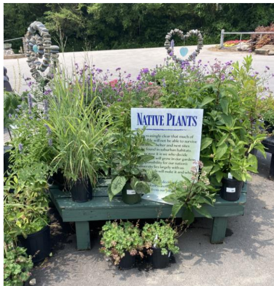
Fig. 1. Native Plant Display at a Retail Garden Center In Tennessee.

Plants provide people with a plethora of benefits. Given the increased demand for native plants and consumers heightened interest in sustainability, we set out to explore potential motivations for purchasing and using native plants in one's landscape. Here, we discuss insights from a 2022 HRI-funded study addresses this topic that was conducted in collaboration with Drs. Ariana Torres (Purdue Univ.), Sue Barton (Univ. of Delaware), and Bridget Behe (MSU).