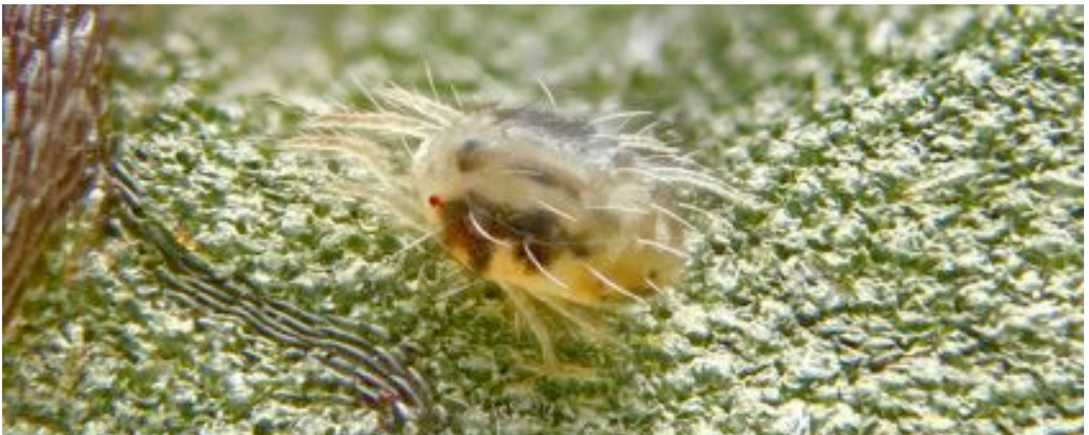
Figure 8. Spider mite females have a clear body and a tan coloration and can be observed with a 20X microscope.