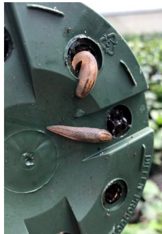
Figure 6. Slugs can be found in the interior plant canopy or at the bottom of the pot.