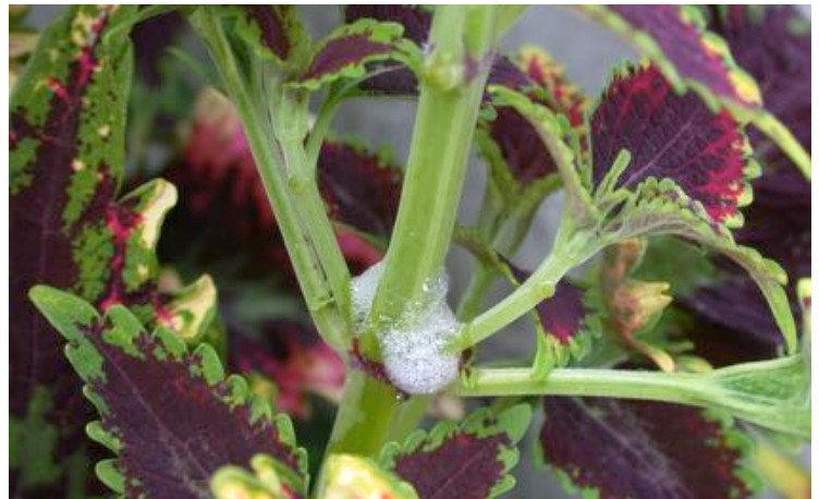
Figure 9. Spittlebugs are mainly only a pest in landscape plantings.