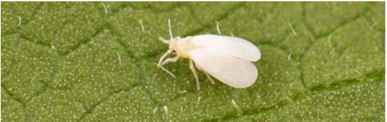
Figure 11. An adult whitefly is easy to see on most plant leaves.