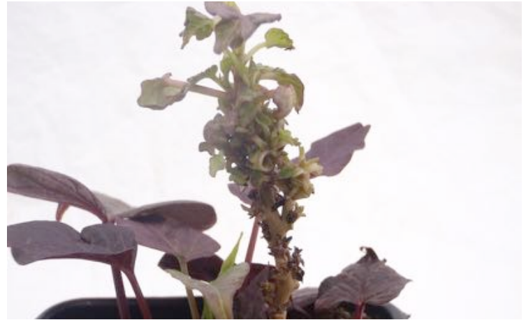
Figure 3. Distorted new growth is the typical symptom of a broad mite infestation, as seen here on ornamental ipomoea.

While broad mites infestations are uncommon on coleus. Most likely, problems are more prevalent when growers retained their own stock plants from year-to-year, which allowed for a build up of broad mites. Another common instance is when infested hanging baskets are suspended above a crop and the pest fall to the crop below. Nonetheless, broad mites are very small and require 100X magnification to view (Fig. 2). Broad mites cause the new growing tip to become distorted and hard (Fig. 3).