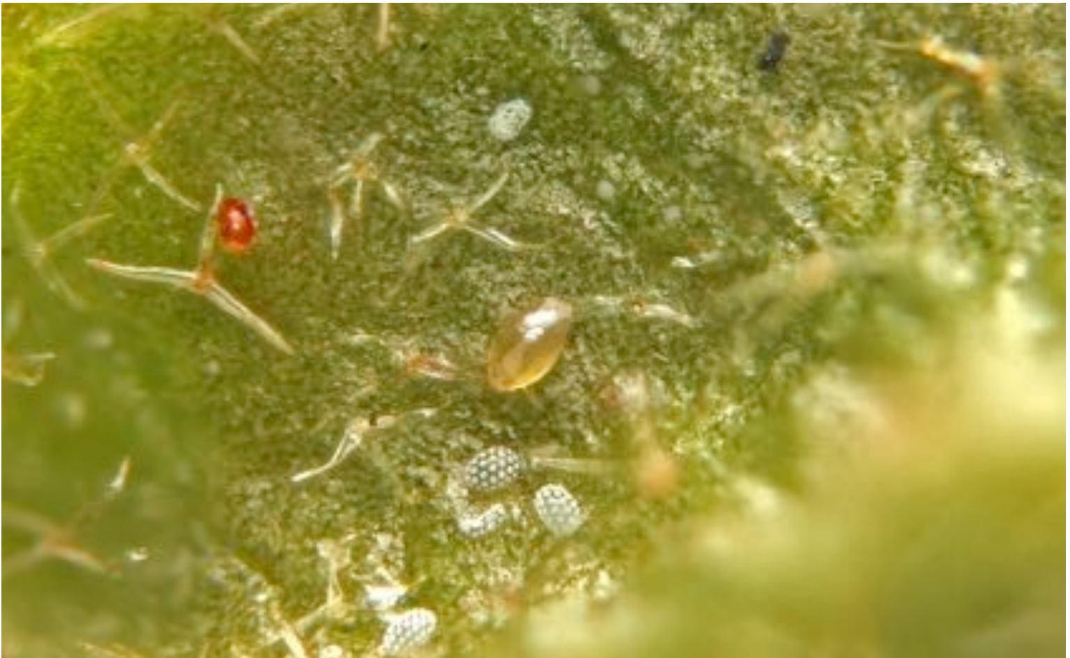
Figure 2. Broad mite female and oval eggs can be observed with a 100X microscope.