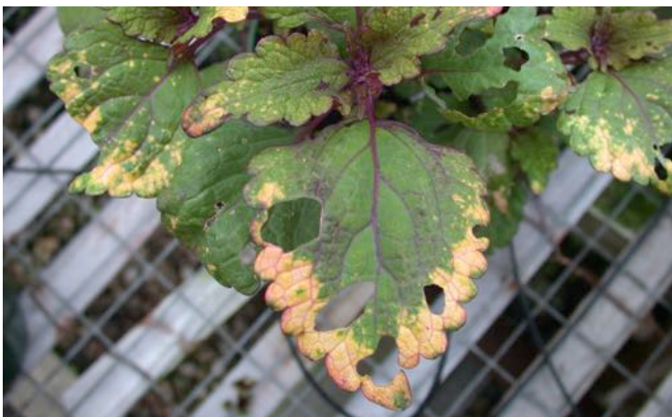
Figure 5. Holes in leaves are usually the result of slug or caterpillar feeding. A slime trail and finding a slug will help identify the problem.