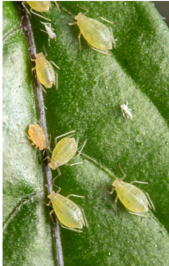
Figure 1. Aphids are reported as a pest problem on coleus.

In addition, e-GRO authors have observed Western flower thrips, spittlebugs, caterpillars, and slugs on coleus.