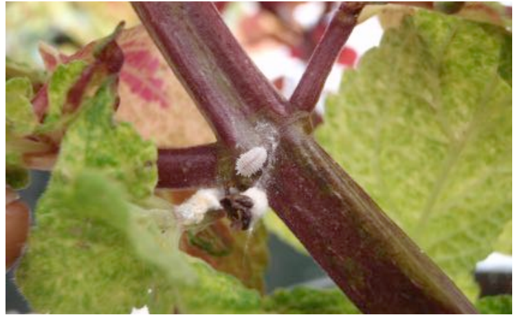
Figure 7. White insects on coleus usually denote a mealybug infestation. (Photo: Brian Whipker)

Spittlebugs are typically a pest of landscape plants. The immature insect can be found in the protective spittle (Fig. 9). (Photo: Brian Whipker)