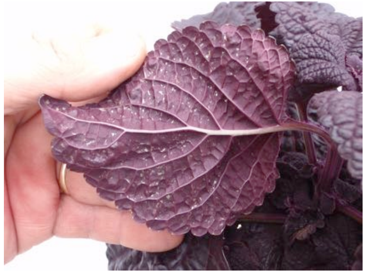
Figure 10. Western flower thrips may only feed on the lower leaf surface, thus making detection a challenge.