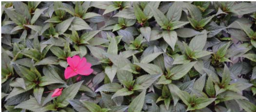
Figure 2. Premature and nonuniform flowering of New Guinea impatiens in propagation.

clock of crops with sporadic or non-uniform flowering such as New Guinea impatiens to zero (Figure 2) by causing flower and flower bud abortion. Additionally, some growers use it to increase branching and reduce stem elongation of petunia (Figure 3). Ethephon (ie. Florel or Collate) sprays are typically applied