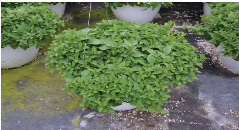
Figure 3. Increased branching, reduced internode elongation, and flower bud abortion on petunia treated with ethephon.

Similar to most greenhouse chemicals, ethephon is applied as a liquid. As ethephon changes to ethylene, it changes to a gaseous form. When ethephon is applied to and absorbed by the plant, the pH increases, releasing ethylene. Therefore, we do not want