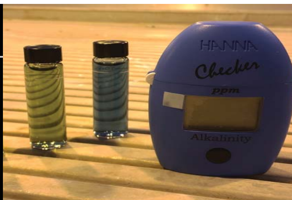
Figure 6. Portable and hand-held alkalinity meter that can be used in the greenhouse to determine your carrier water alkalinity.