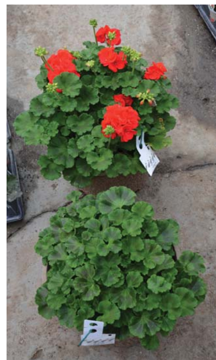
Figure 1 (right). Untreated geranium (top) and geranium treated with ethephon (bottom).